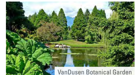
VanDusen Botanical Garden